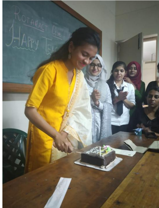
7] Birthday celebration of office bearers.