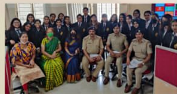
Industrial Visit to the Police Commissioner Office