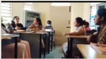
Inter- Class Debate Competition