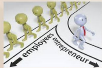
An animation showing how entrepreneurship is different from others