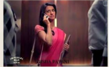
This is a still from one of the advertisements of Imperial Blue. The two men hold back their stomach until the lady leaves

There has been constant effort put by the companies in order to grab the audience attention by making advertisements that are not stereotypical. For example the Dove soap and shampoo advertisement where all skin colours and hair types are in the limelight, Pril advertisement where the male character is doing the chores, etc. Each of us have to put in constant effort into not giving into the stereotypical opinions. We should judge a person for who they are and not what group they belong to.