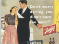
An image of an advertisement portraying how women are treated

Advertisement is a source which informs every individual about brands, products, ideas etc. They are portrayed in both positive and negative, it is important to see how ads portrayals are perceived by consumers. In television most of the advertisements are shown to promote a product, brand and service in order to attract interest and sales, and some advertisements also create awareness. Some advertisements affects society and affects our life where we have an economic system in which people have to make money in order to survive, no matter how manipulative techniques they use to achieve the attraction of the people and this can be clearly seen in advertising industry