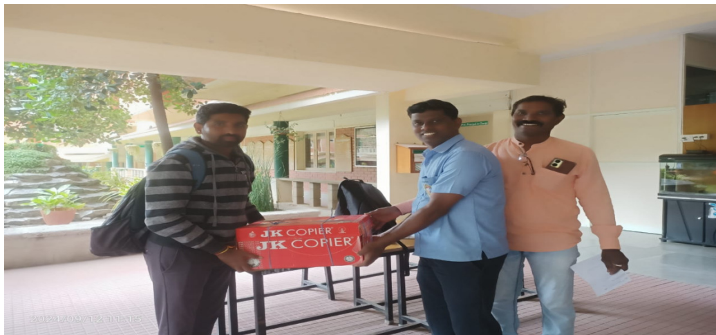
Receiving the stationery from the recycled papers