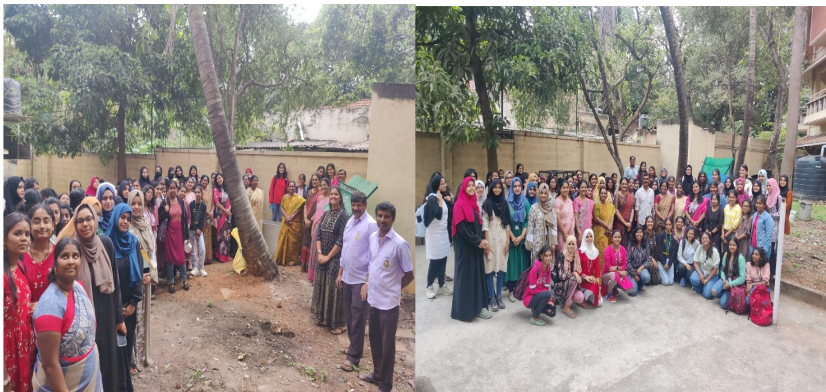
Vermicomposting unit installation