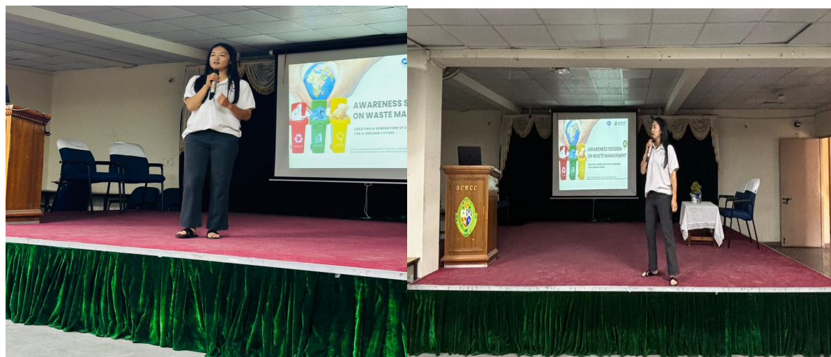
Awareness on waste segregation

All the paper waste from various departments and office was collected and sent to ITC for recycling who turned recycled paper into new useful paper items like files and pen stands. This prevents waste and also conserves resources and energy used when making paper from scratch. By reusing paper, we prolong the lifecycle of the materials and reduce carbon footprint of the manufacturing process.