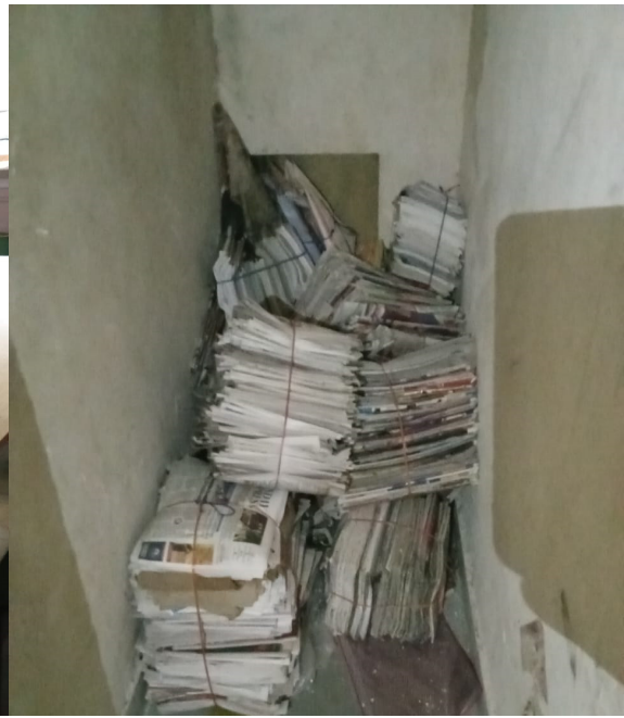
Paper collected from Departments and office