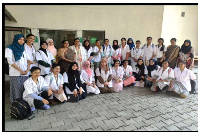
III- B.Sc – Visit to the dietary department at Fortis Hospital