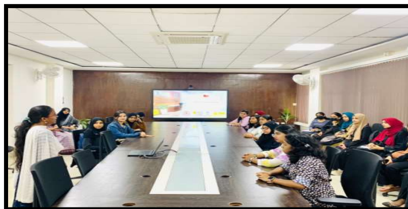
III B.Sc -Visit to the Coffee Board of India