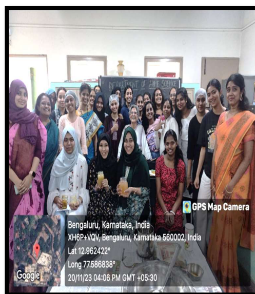
Workshop on Food Preservation