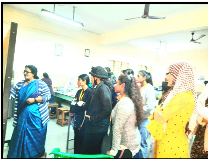
Open Day for II PU