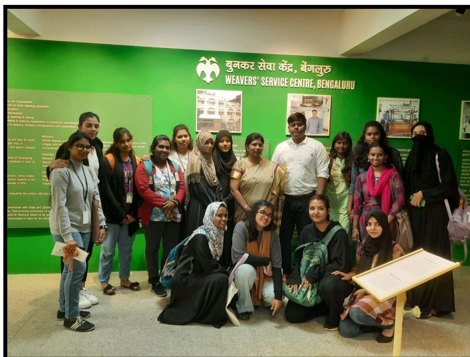
Visit to WEAVERS Association