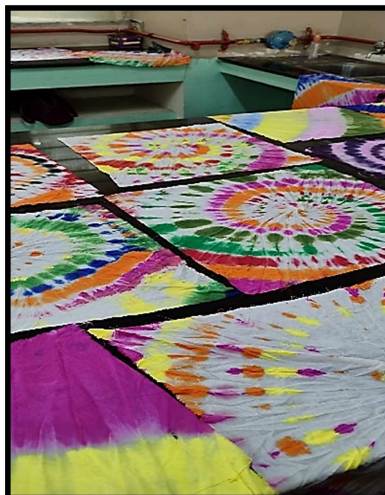
Workshop on Tie and dye, Stencil Printing, Batik, and Block Printing