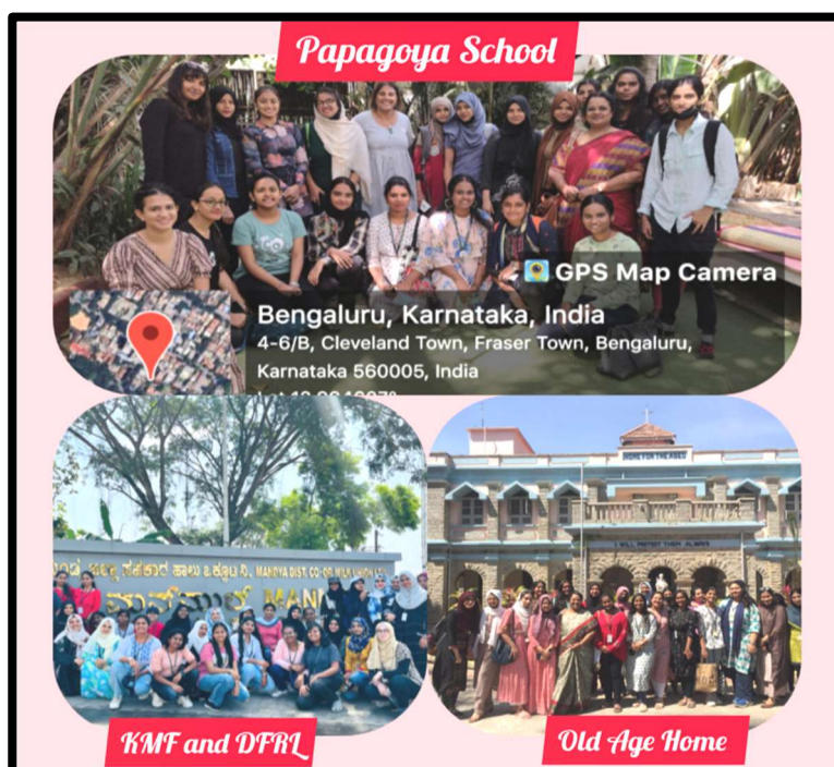
Visits conducted by the department