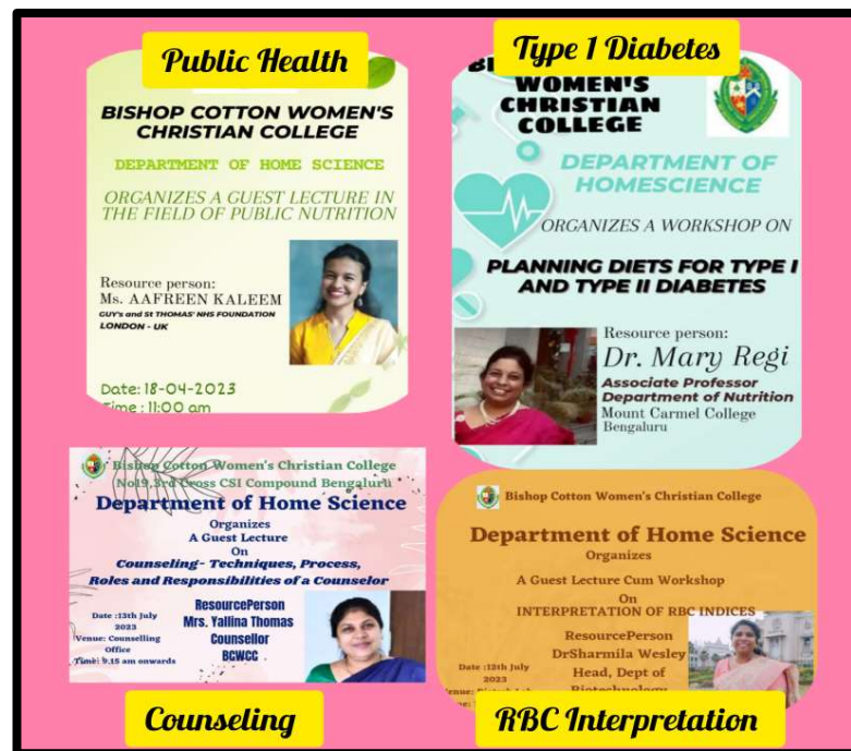
Guest Lectures conducted by the department