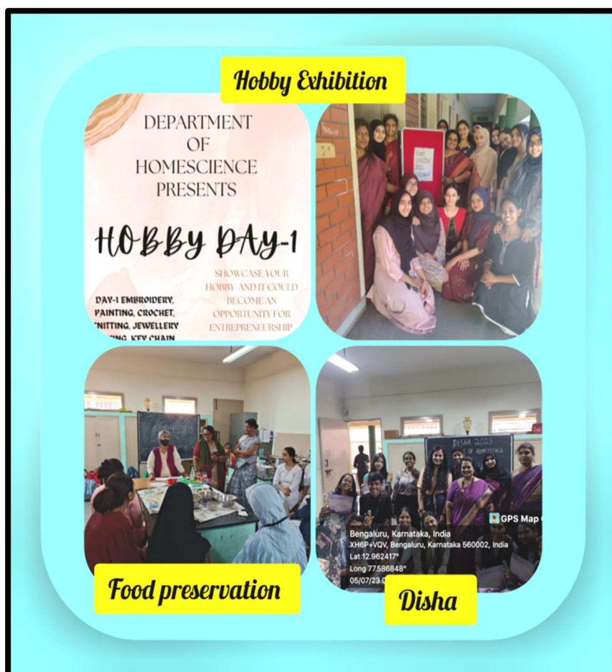
Workshops conducted by the department