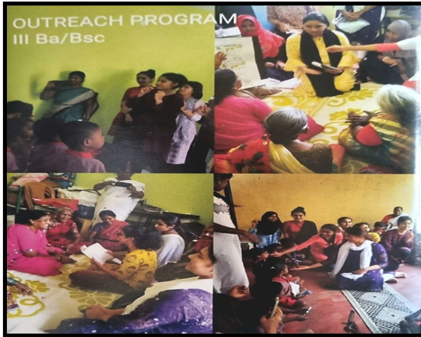
III BA/B.Sc. Outreach program