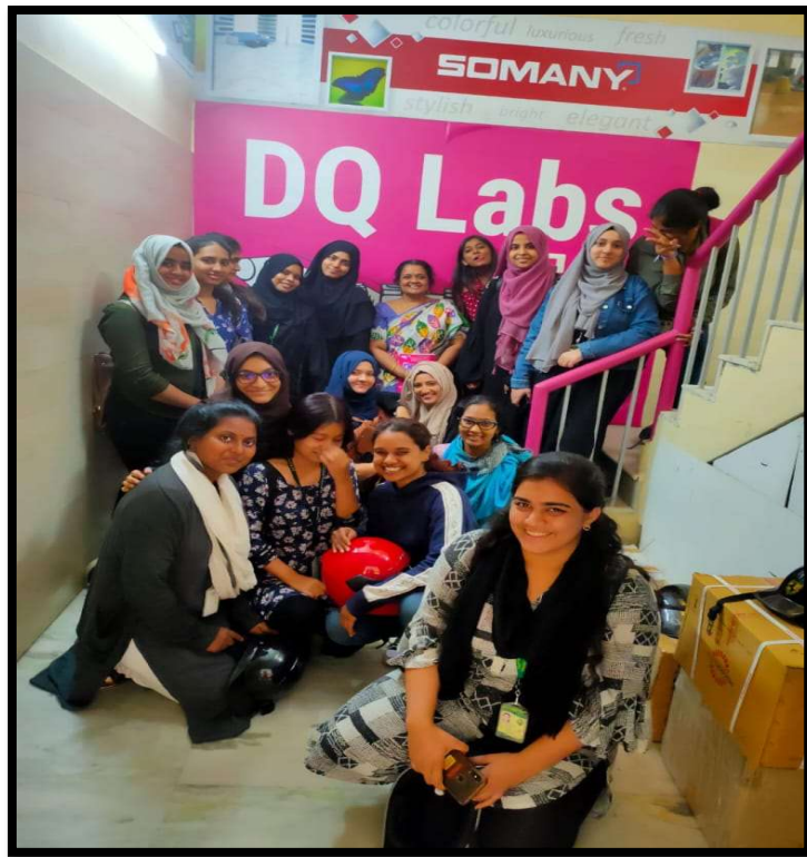
Visit to Design Quotient Lab