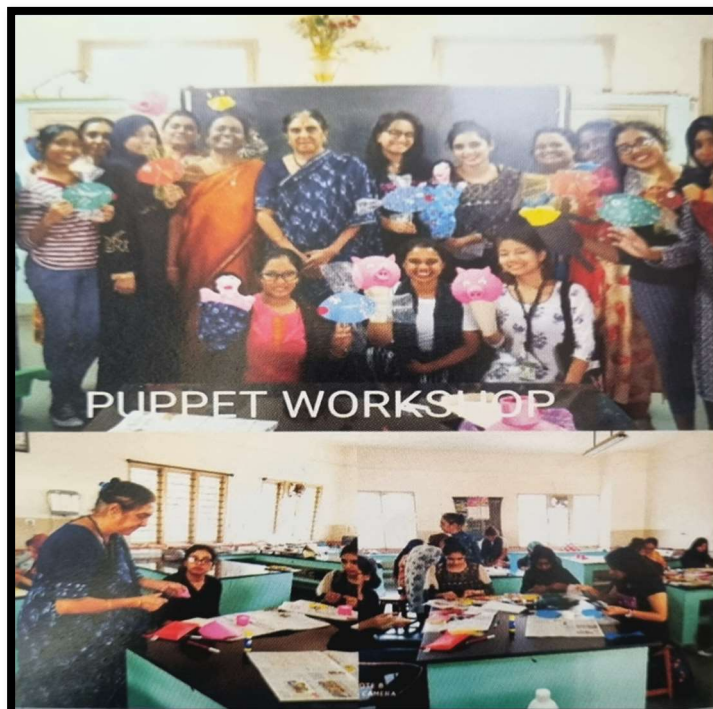
VI BA/B.Sc- Puppet Making