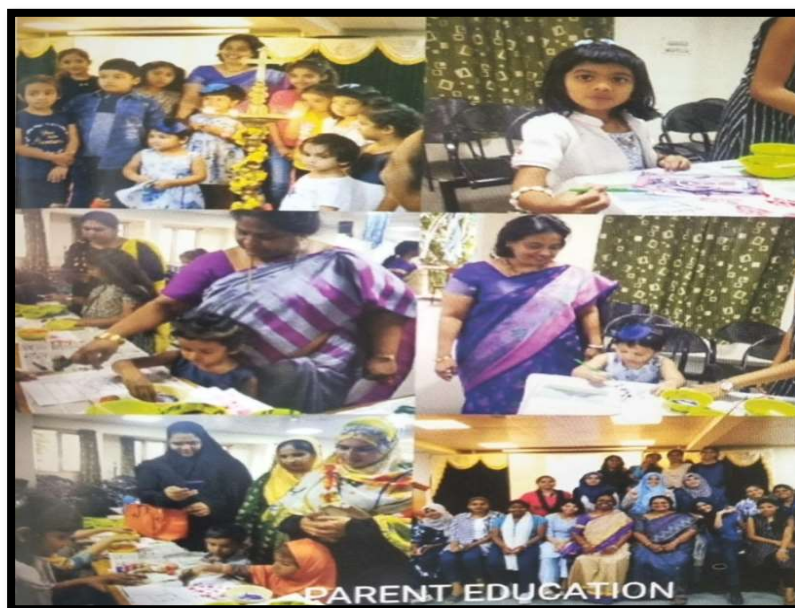
Parent Education Program