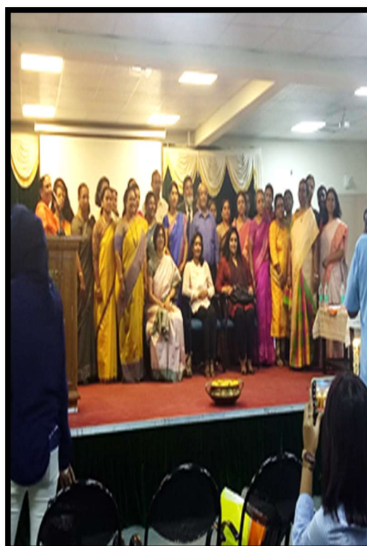
‘International Multidisciplinary Symposium Swasthya’ – Way to Wellness