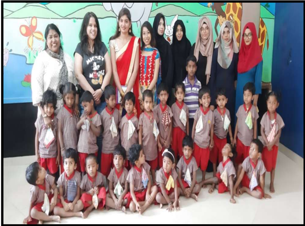
Visit to Arathi – Play School