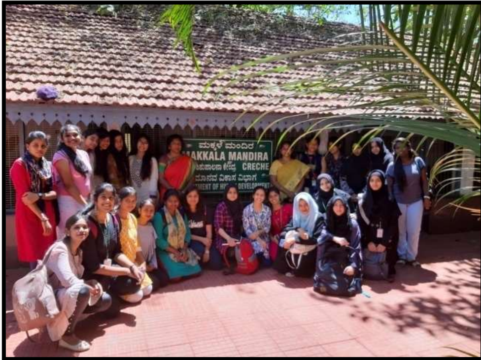
Visit to Makalla Mandira