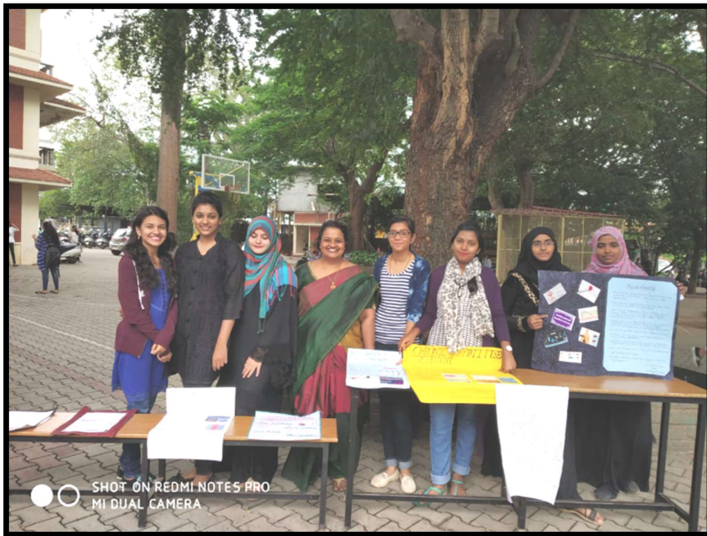
Awareness program on Hepatitis B