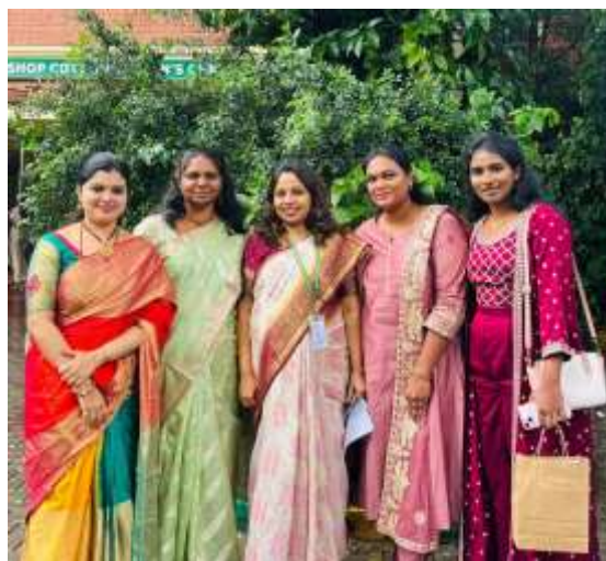
Prize winners and Judges of the event Flash the Chem Flask.

A Laboratory visit to Chariton Research Institute Private Limited, Yeshwanthpur, Bengaluru on 11 th December 2024. Around 16 students from II & III BSc were prioritized to take part which could benefit them to find internships and other minor projects. The institute provided an insightful explanation ON working of microbiology instrumentation lab, environment protection and pollution control lab and other instruments like spectrophotometers, densitometer, digital viscometer, Atomic absorption spectroscopy and so on.