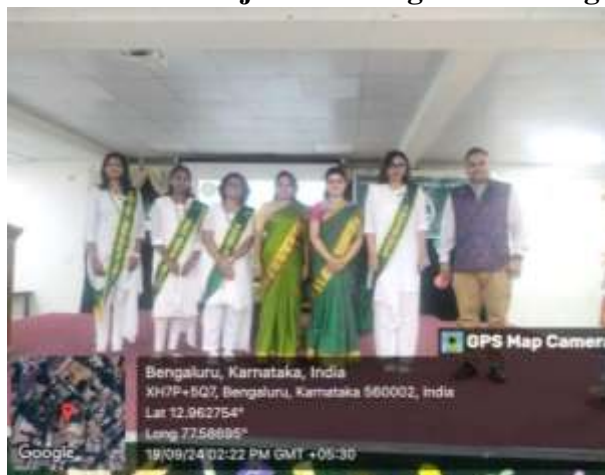
Resource person, Faculty from the Department of Chemistry and the sworn office bearers of Bishop Cotton Chemical Society