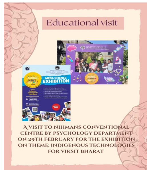
Department of Psychology

Awareness Drive for the First Time Voters The Department of Political Science with the Electoral Literacy Club in collaboration with Bahutva Karnataka Organization organized an Awareness Drive for the First Time Voters, The program mainly highlighted the role of first time voters in shaping the future .Around 260 students attained the program.