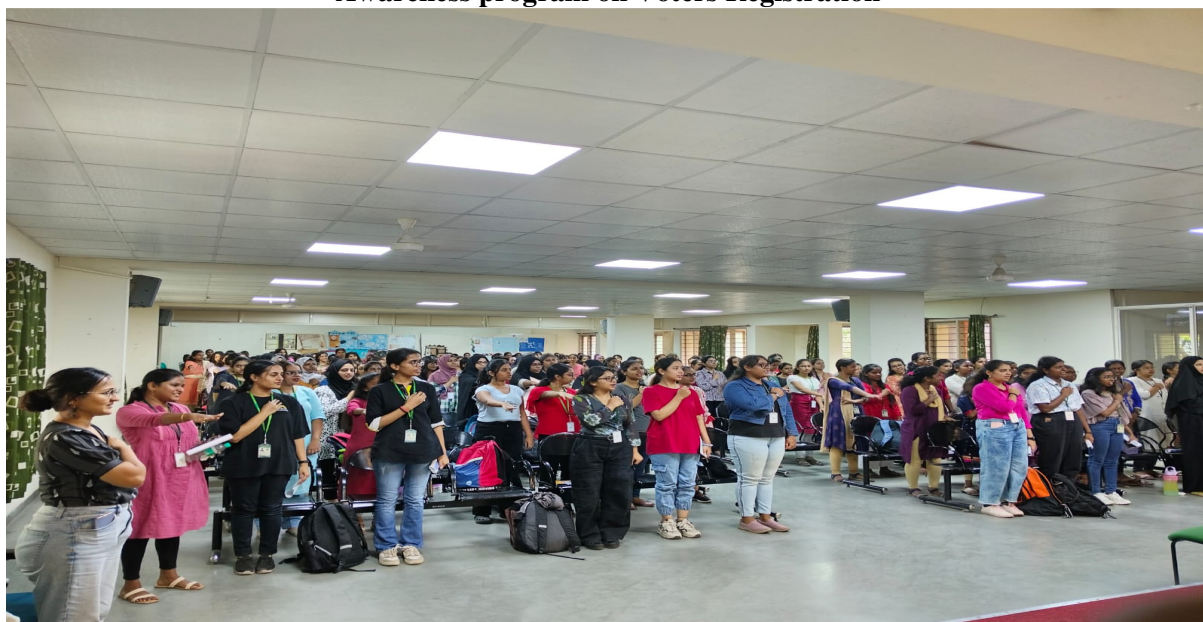
First time voters

Public Speaking Skill Activities To encourage effective communication skills and to reduce stage fear, various soft skills activities such as debate, group discussions and leadership and problem solving exercises were conducted as part of practical activities during the class hours for the final year students. Class Debate As part of the public speaking skills, a debate was conducted for the final year students during the class hour on the topic "Is Indian Media Ethical in Reporting issues".