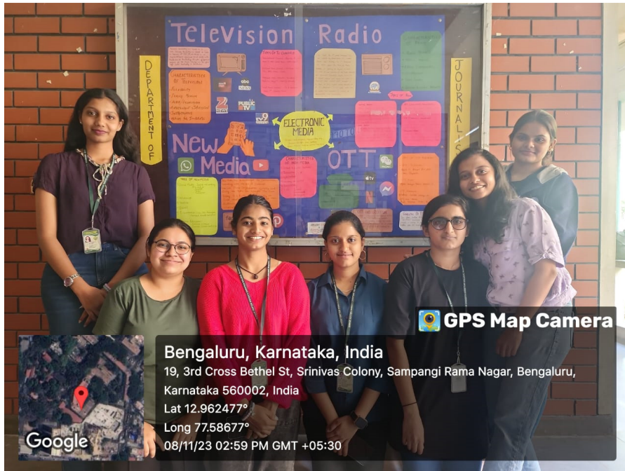
Department of Journalism