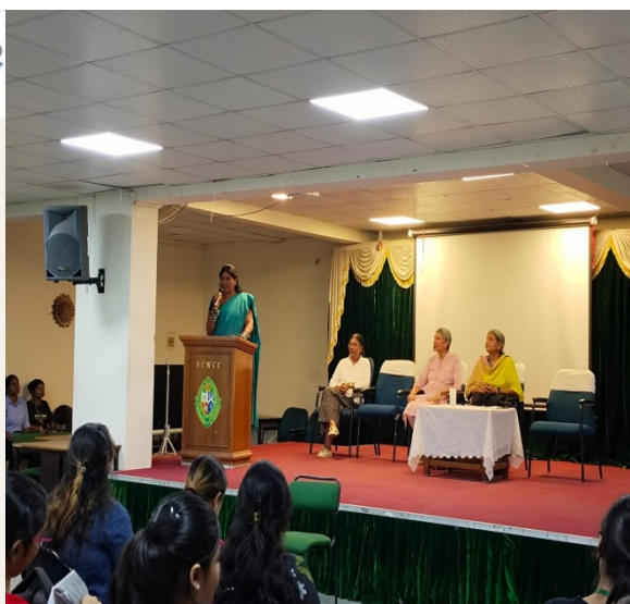
Awareness program on Voters Registration