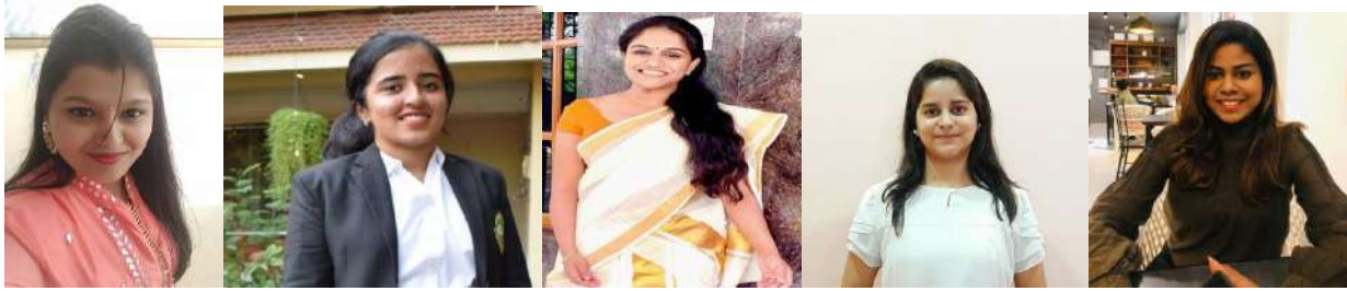
President Vice president Secretary Joint secretary Treasurer